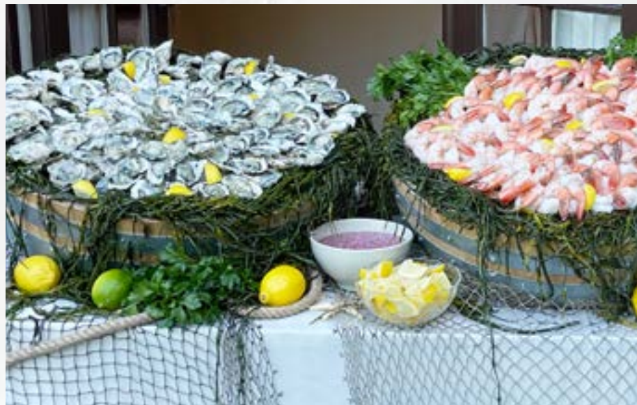
Raw Bar (+$6 PP)