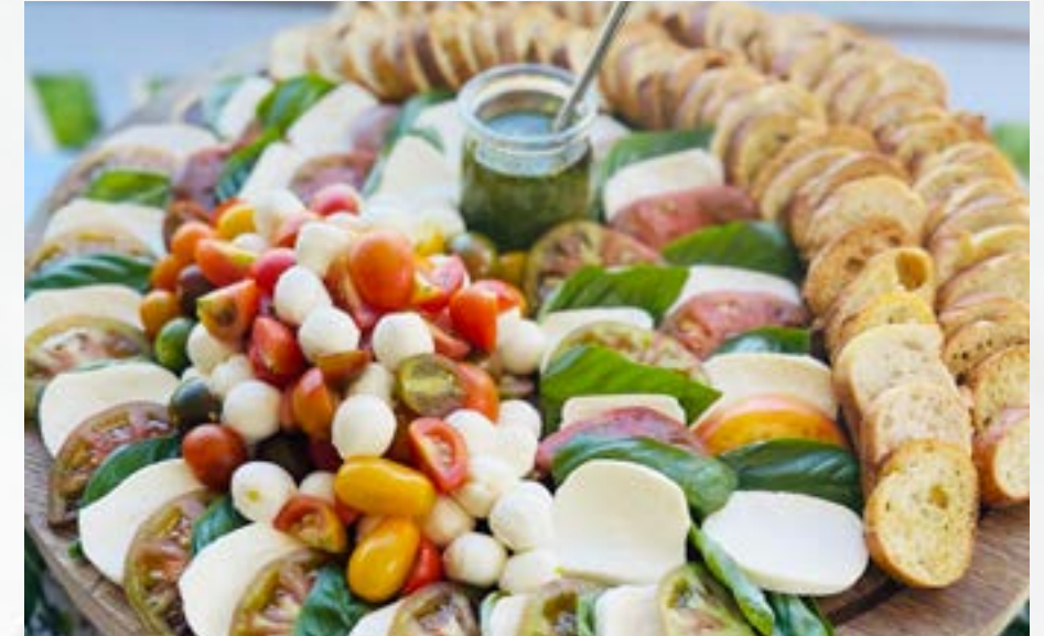
Tomato & Mozerella Bar