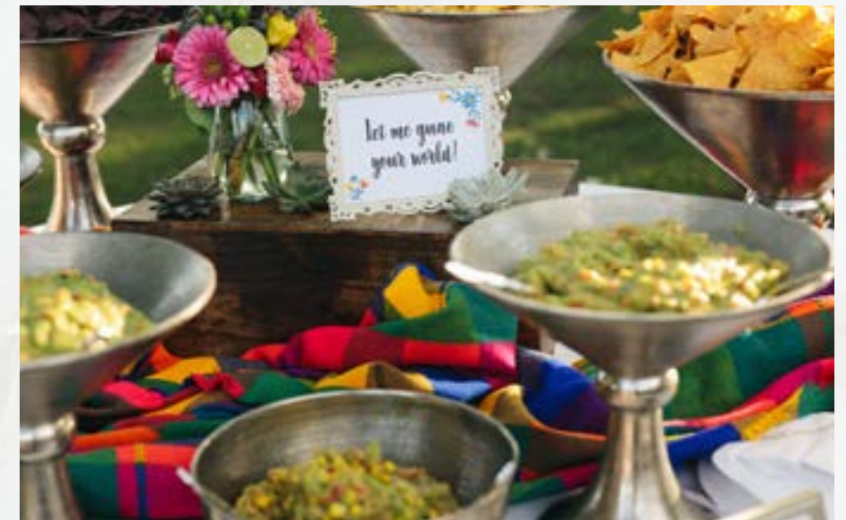
Guacamole & Salsa Station