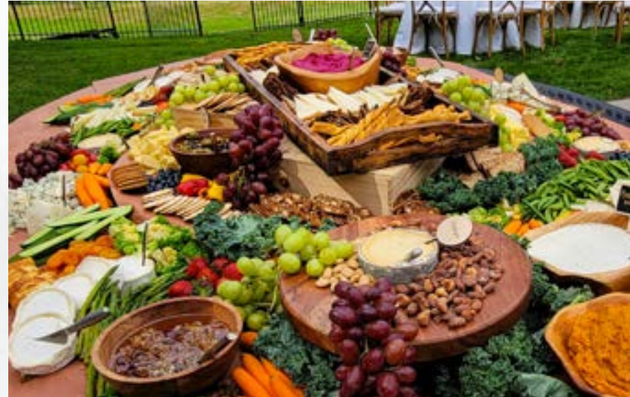
Farmer's Market Table