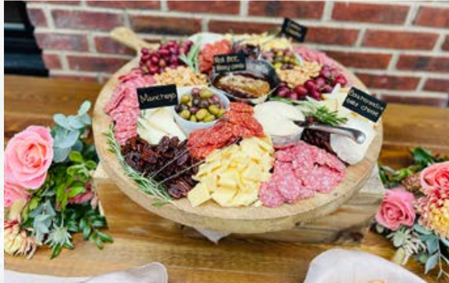
Artisanal Cheese & Charcuterie